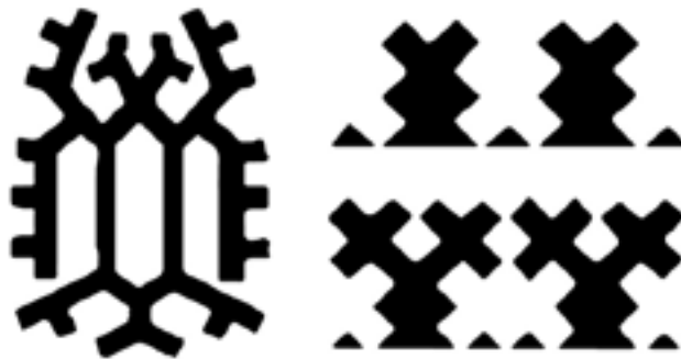
Figure 1. Examples of ornaments with a bear. Left: A Bear; top right: Bear's ears; top left: Bear's track.

In our fieldwork, we encountered different variations (and violations) of traditional ornaments including those from sacred groups, but the most widespread and, at the same time, most neglected in terms of meaning and composition were ornaments and patterns of 'everyday use.' Being simple and laconic and therefore readily recognizable and associational, they are closer to contemporary culture (contemporary signs) and are easier to perceive.