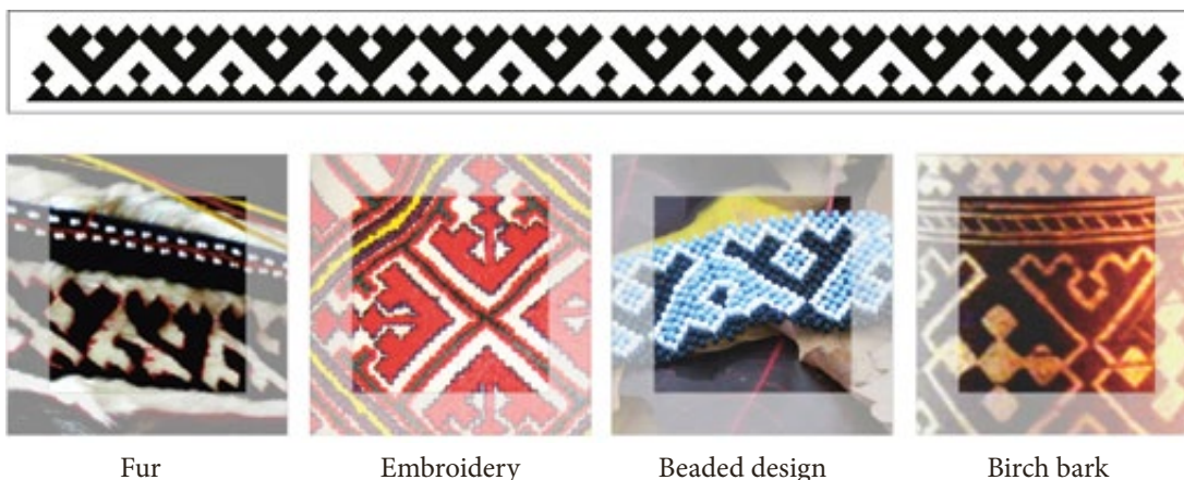
Figure 2. The ornament 'Hare's Ears' / 'Beautiful Reindeer Horns.'

The algorithm of analysis progresses from the general to the specific, from establishing the regional boundaries of the ornament, its applications, composition, interactions with the context and color gamut to the choice of the ornamental motif, its location, scale and size, and definition of the traditional meaning.